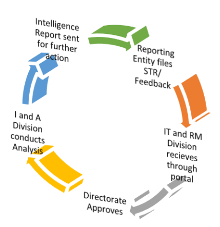
Figure 1: The diagram above shows how STRs are processed within the FIU-SL

Technology and Records Management Division, which channels all filed STRs to the Directorate through the in-house network secured medium for approval and authorisation. The Intelligence and Analysis Division then analyses the information and generates an intelligence report that is disseminated to competent authorities through secured channels for investigative action.