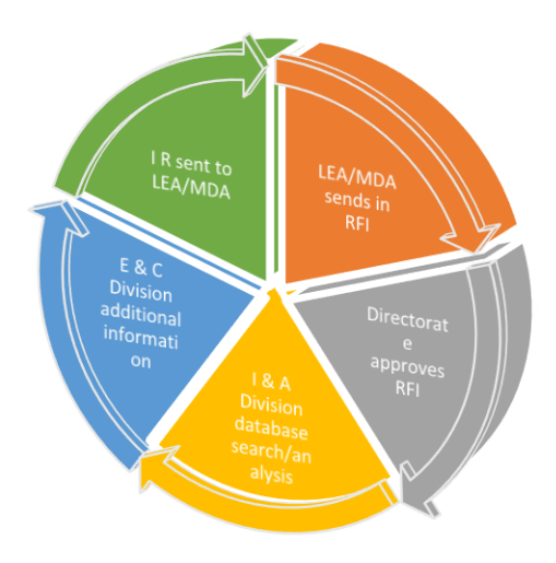
Figure 2: The diagram above shows how RFIs are processed within the FIU-SL

Anonymous Source (AS) — This information is usually provided by an individual who does not want to be identified and can either be a random person or a confidential informant who provides vital information that may be useful in ongoing financial crimes investigations or to commence an investigation. After ensuring verification of the information received, the Directorate gives approval to the Intelligence and Analysis Division to proceed with the analysis process. The process then follows the same pathway as the RFI.